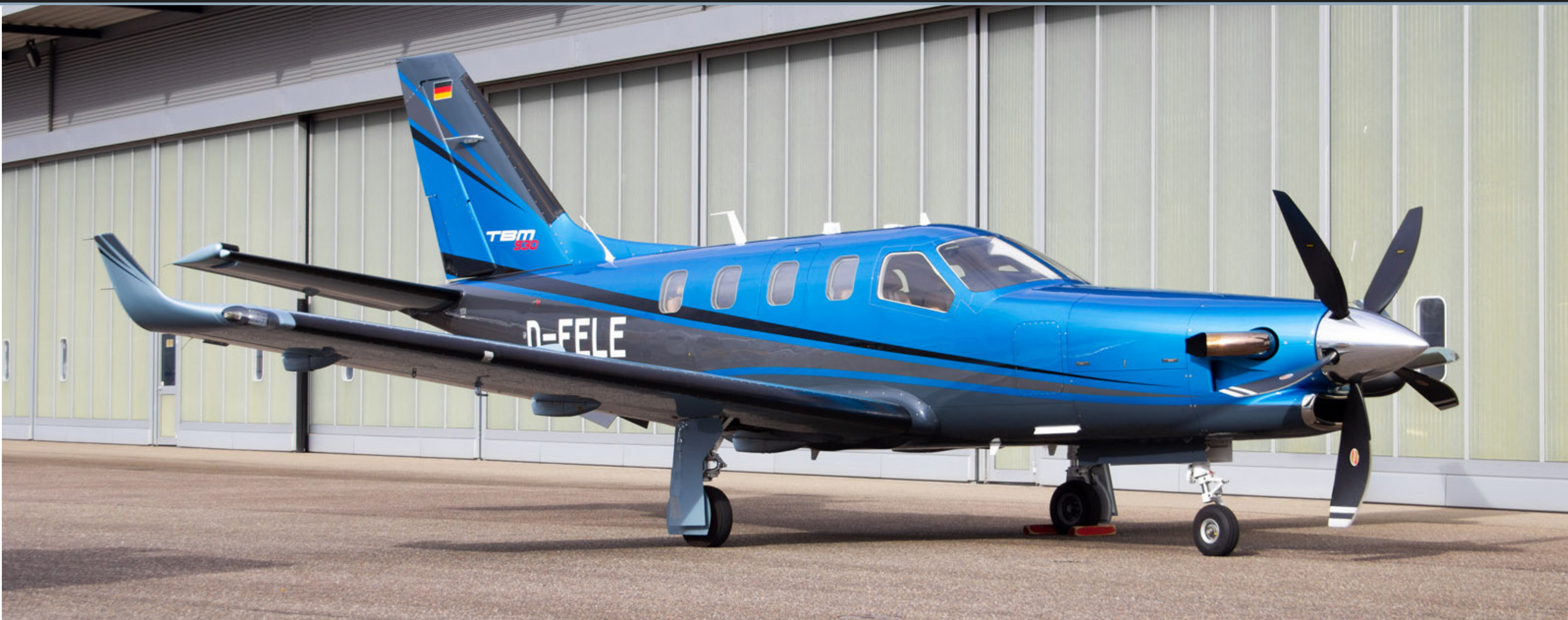
2018 Daher TBM 930 D-FELE SN 1266